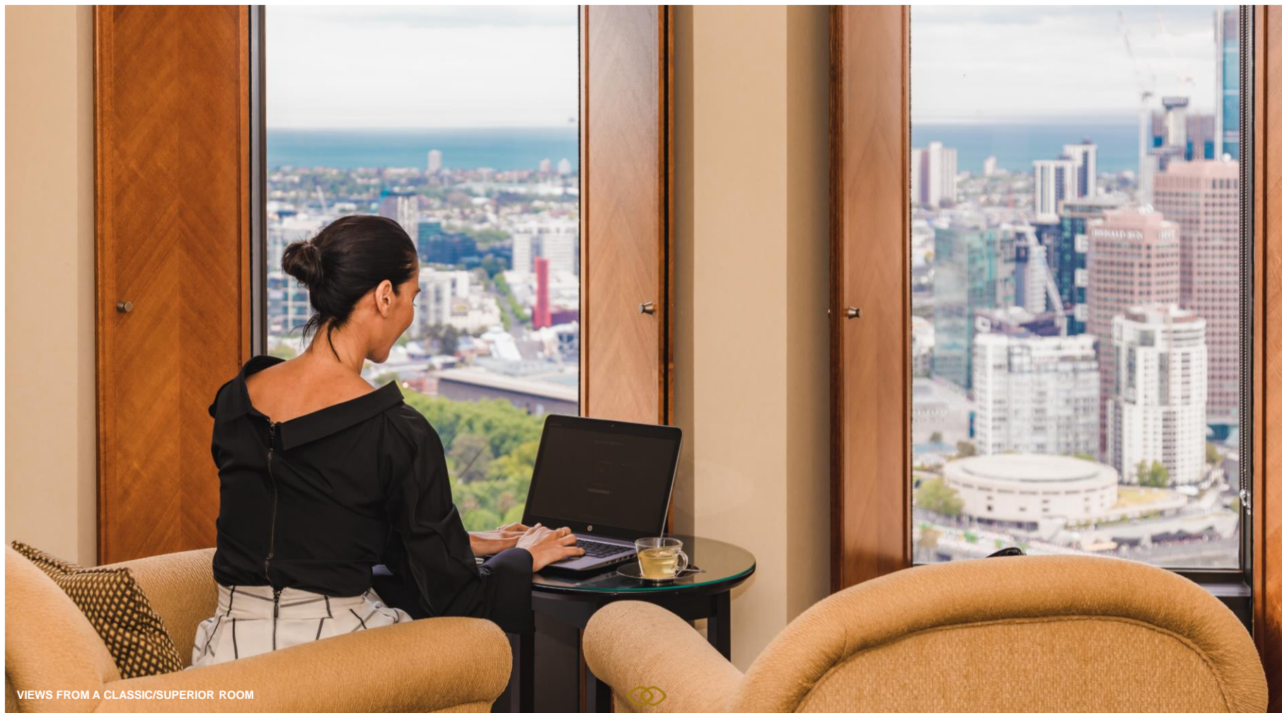
VIEWS FROM A CLASSIC/SUPERIOR ROOM