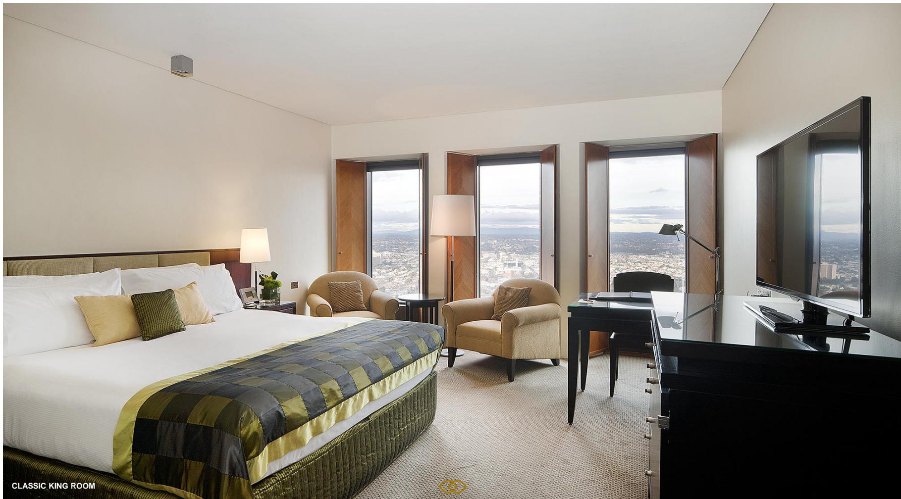
CLASSIC KING ROOM