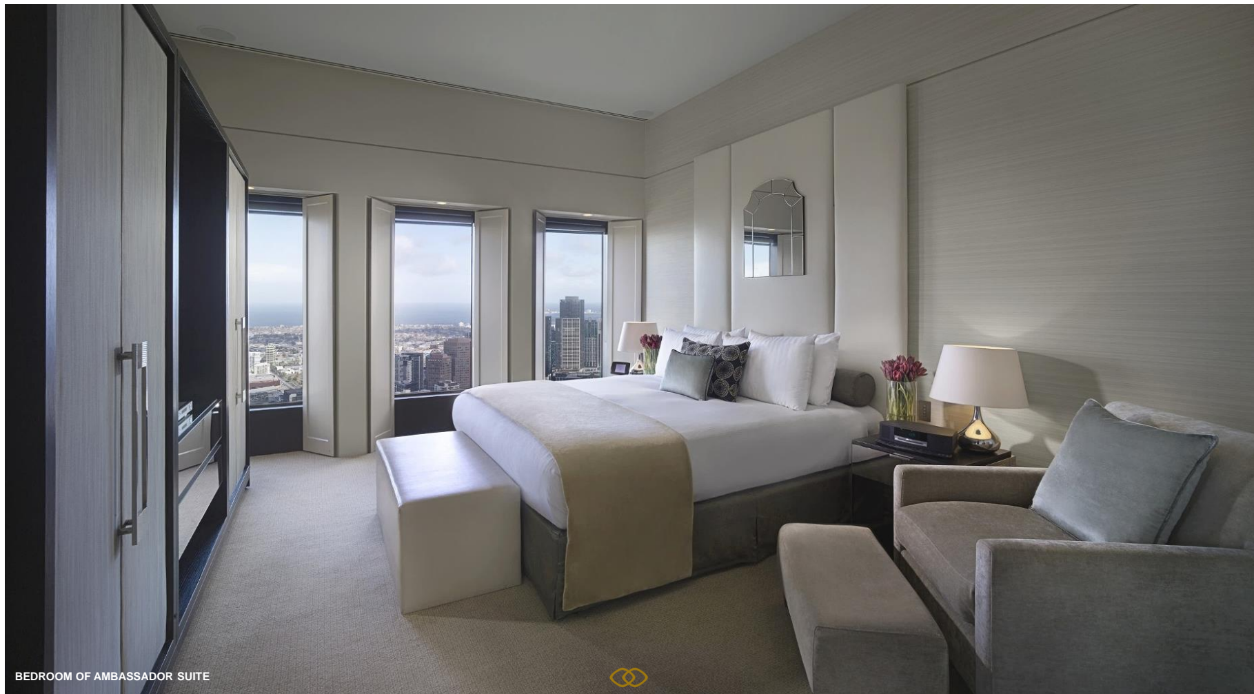
BEDROOM OF AMBASSADOR SUITE