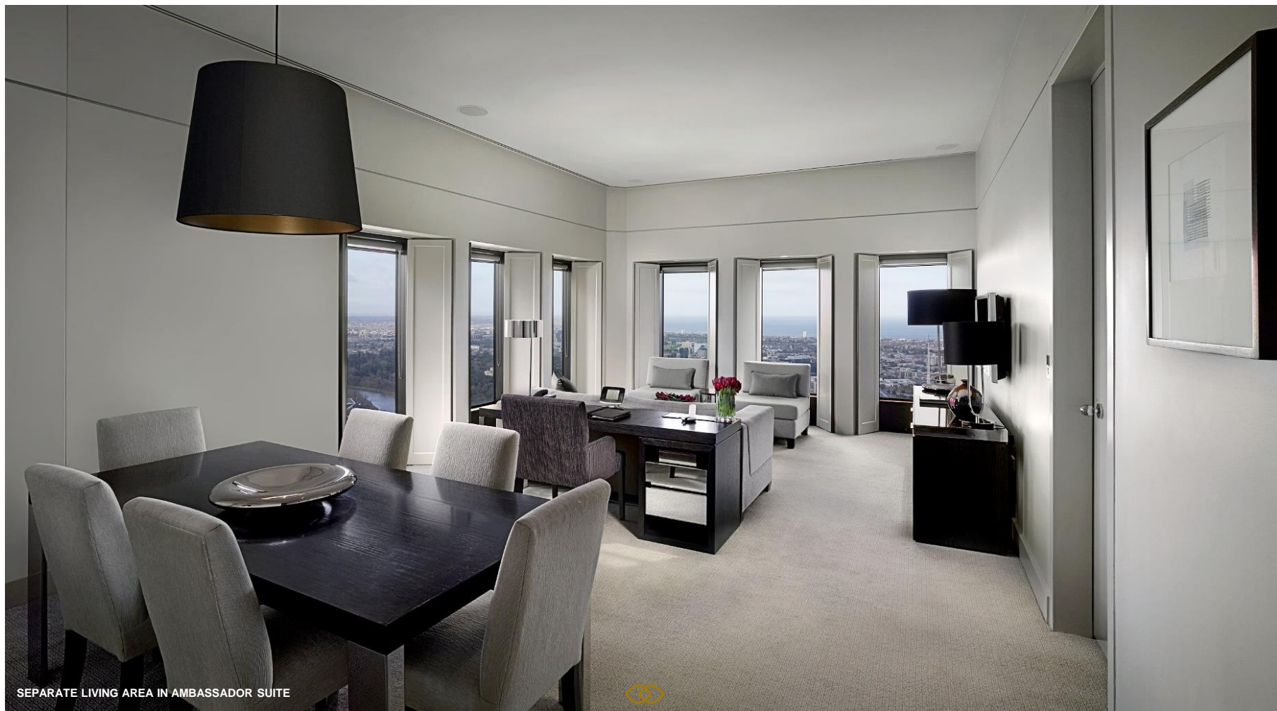
SEPARATE LIVING AREA IN AMBASSADOR SUITE