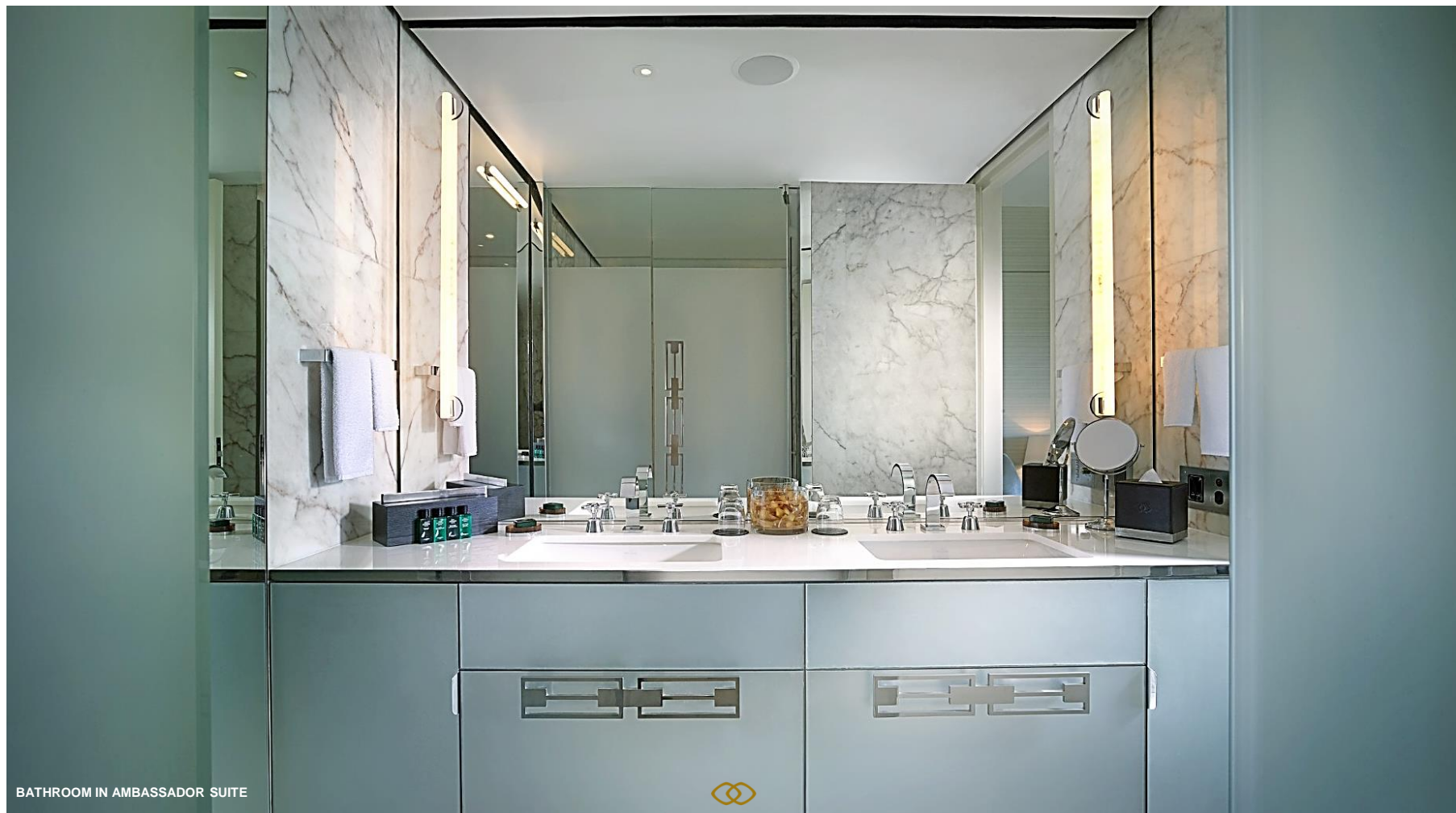
BATHROOM IN AMBASSADOR SUITE