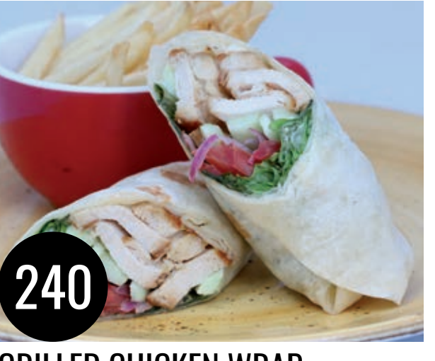
GRILLED CHICKEN WRAP

Marinated grilled beef, diced tomato, red onion, cucumber, lettuce, yoghurt, French fries