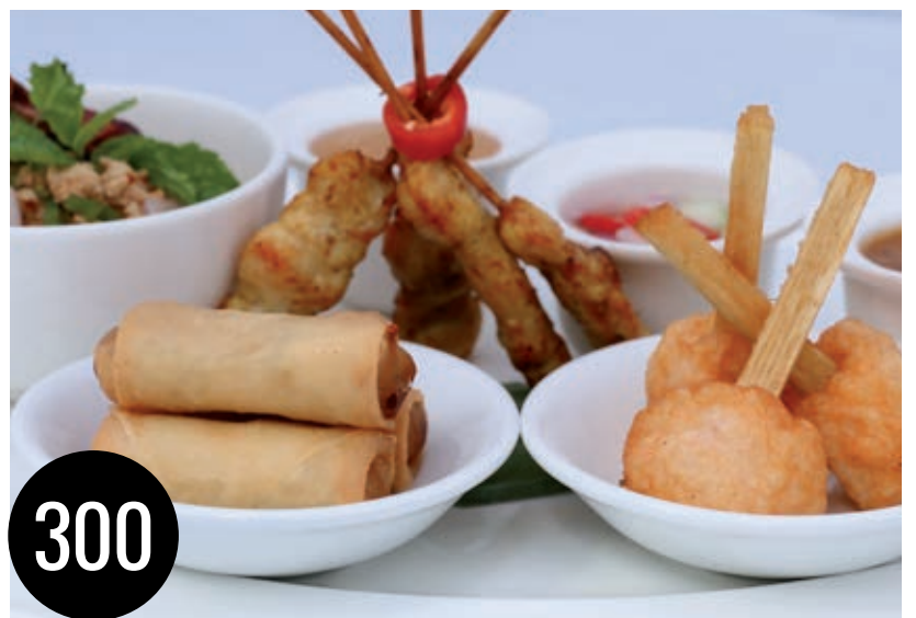
SIAM THAI PLATTER Selection of Thai favourite appetizers: Lab kai, mixed spring rolls, goong phan oye, chicken and pork satay, sweet peanut sauce