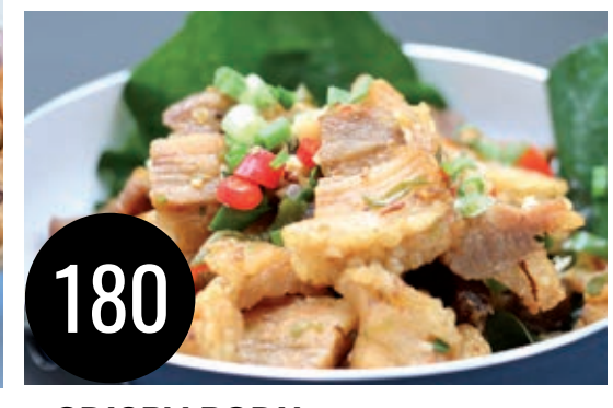
CRISPY PORK Stir fried pork belly BELLY WITH with fresh chili, garlic, THAI HFRB spring onion