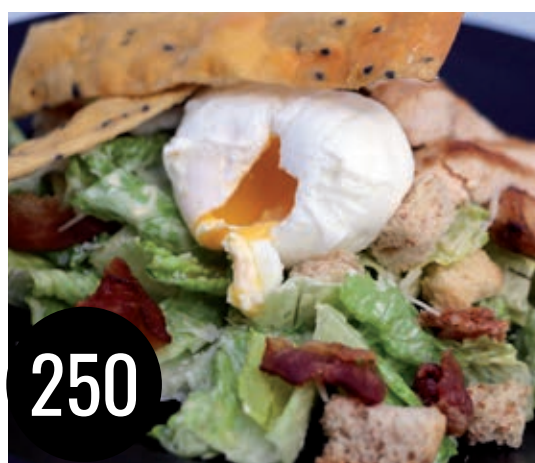
CAESAR SALAD Romaine lettuce, grilled chicken, croutons, crispy bacon, Parmigiano, poached egg, anchovies, Caesar dressing