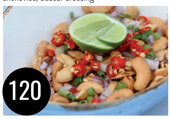
CASHEW NUT SPICY SALAD Crispy cashew nut with fresh chili/ lime dined/ spring onion/ red onion