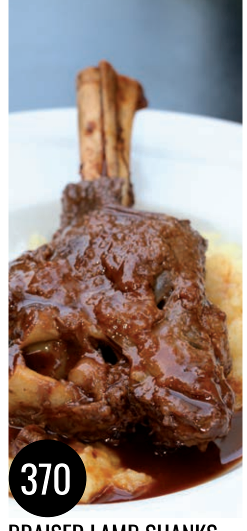
BRAISED LAMB SHANKS