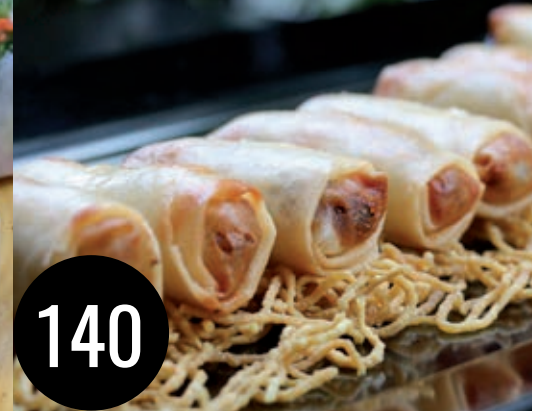
FRIED SPRING ROLLS Vegetable spring rolls served with plum sauce