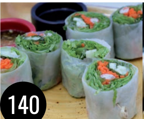
FRESH SPRING ROLLS Spring rolls wrapped with shrimp, cucumber, carrot, green onion, fresh herbs