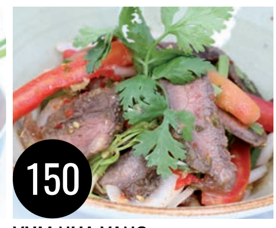
YUM NUA YANG Grilled beef salad with shallots, lime, mint and chili