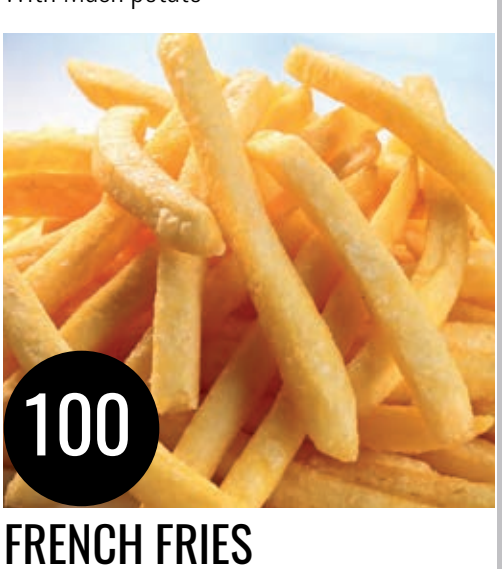
With Mash potato