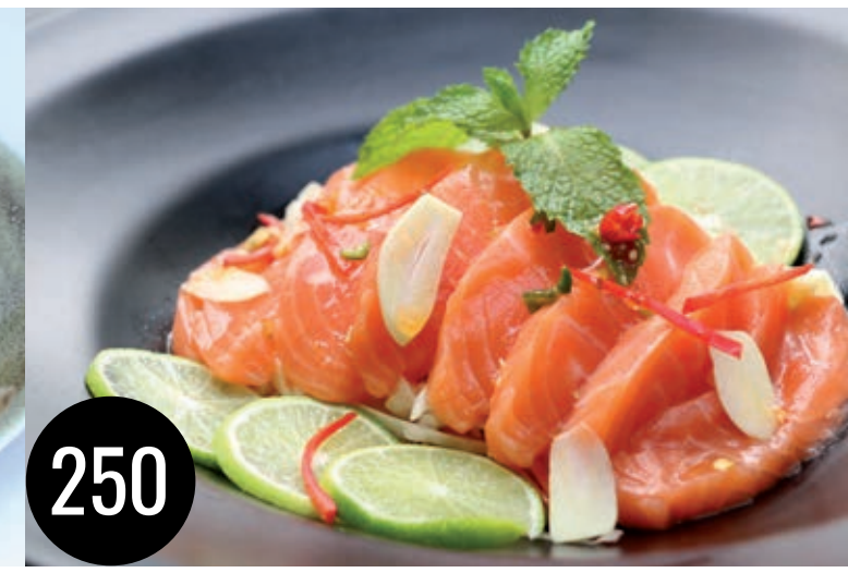
FRESH SALMON CHILI & GARLIC SAUCE Fresh salmon tenderloin topped with seafood sauce, garlic & Mint leaves