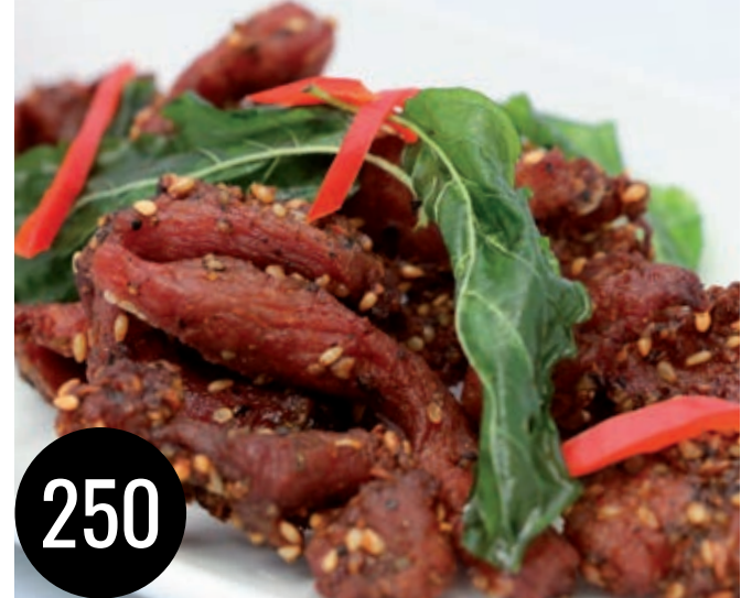
SUNDRIED PORK Marinated deep fried pork with chili sauce