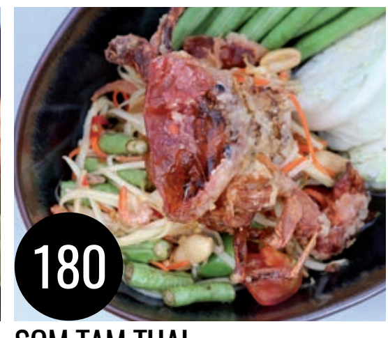
SOM TAM THAI Crispy papaya, soft shell crab, dried shrimps, peanuts, chili, sherry tomatoes