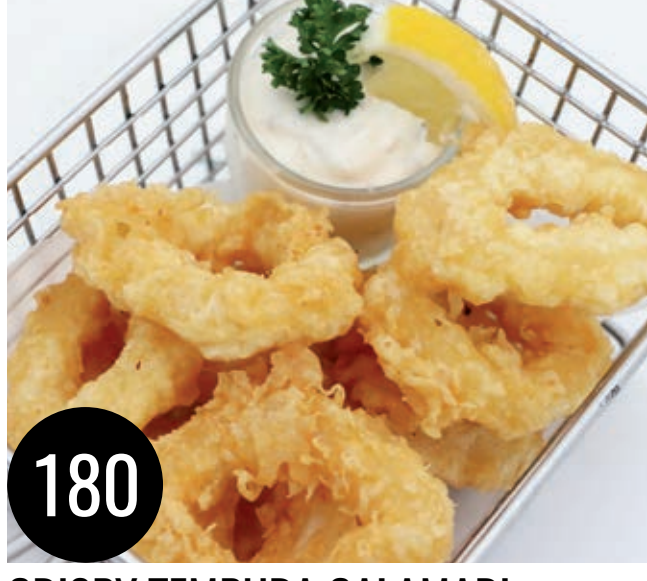
CRISPY TEMPURA CALAMARI Golden fried tempura calamari rings, tartar sauce, lemon wedges