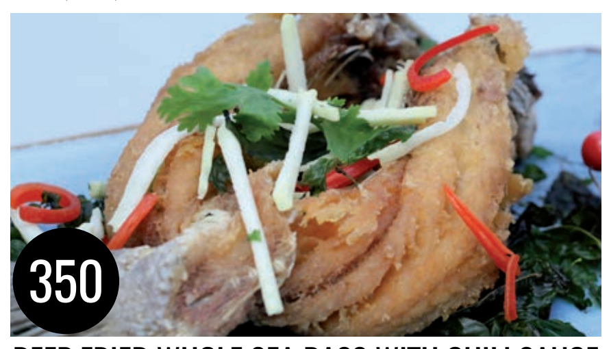
DEEP FRIED WHOLE SEA BASS WITH CHILI SAUCE

Deep fried fish served with Tartar sauce and potato wedge