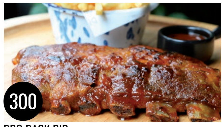
BBQ BACK RIB Marinated barbeque pork spare rib, Grilled tomato, Corn on cob, BBQ sauces