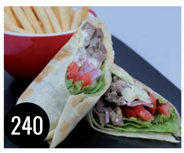
GRILLED BEEF WRAP

Marinated grilled beef, diced tomato, red onion, cucumber, lettuce, yoghurt, French fries