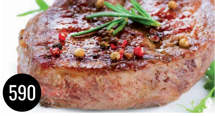
AUSTRALIAN BEEF TENDERLOIN Served Potato wedge Mushroom sauce

Sauces: Chocolate, strawberry, whipped cream