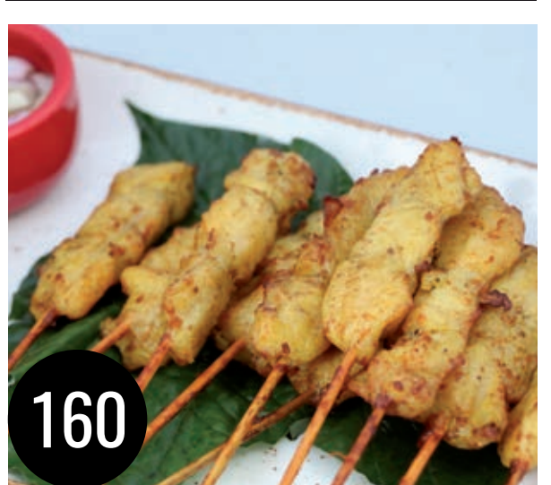
SATAYS Barbecued chicken skewers served with pickled cucumber and peanut sauce