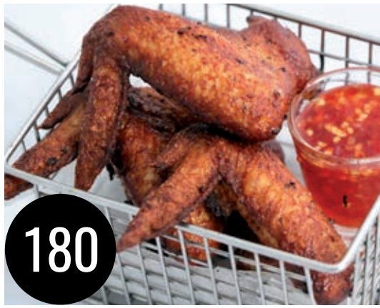
SPICY CHICKEN WINGS Crispy chicken wings served with sweet chili sauce