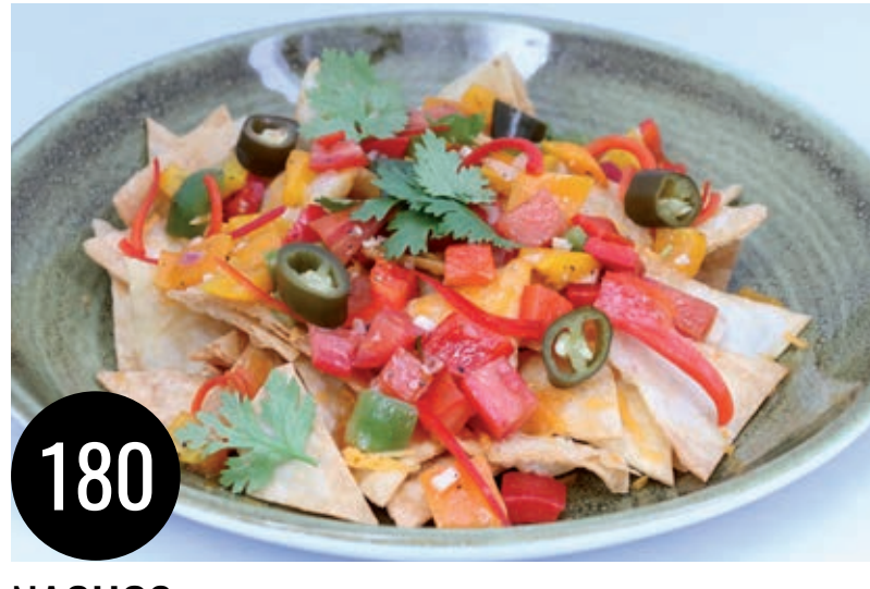
NACHOS Mexican tortilla chips topped with tomato, onion, jalapenos, sour cream, Mexican cheese, coriander, bean sauce