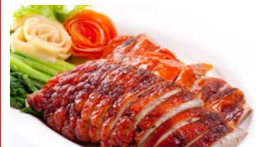
BBQ Roasted Duck เป็ดย่าง THB (S) 490 / (M) 790