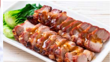
Char Siew Pork หมูแดงอบน้ำผึ้ง THB (S) 390 / (M) 690