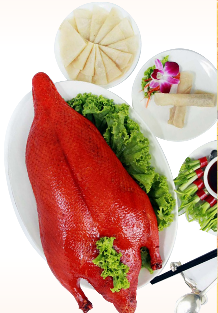
Roasted Peking Goose ก่านปักกิ่ง THB 1,540