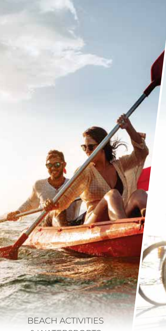
BEACH ACTIVITIES & WATERSPORTS