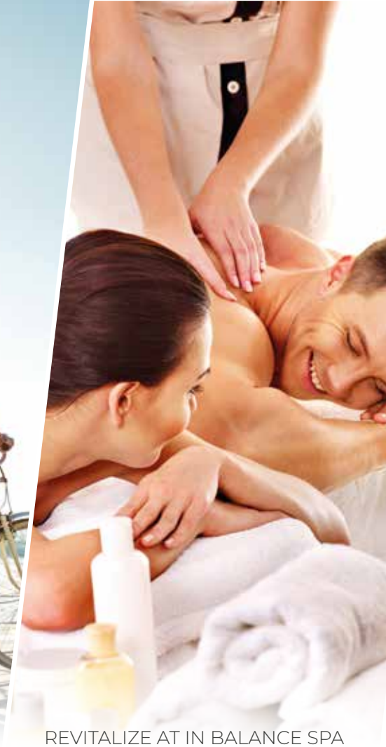
REVITALIZE AT IN BALANCE SPA