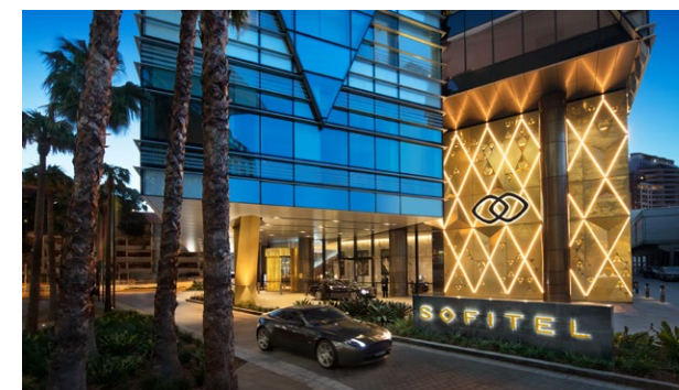
Sofitel Sydney Darling Harbour exterior