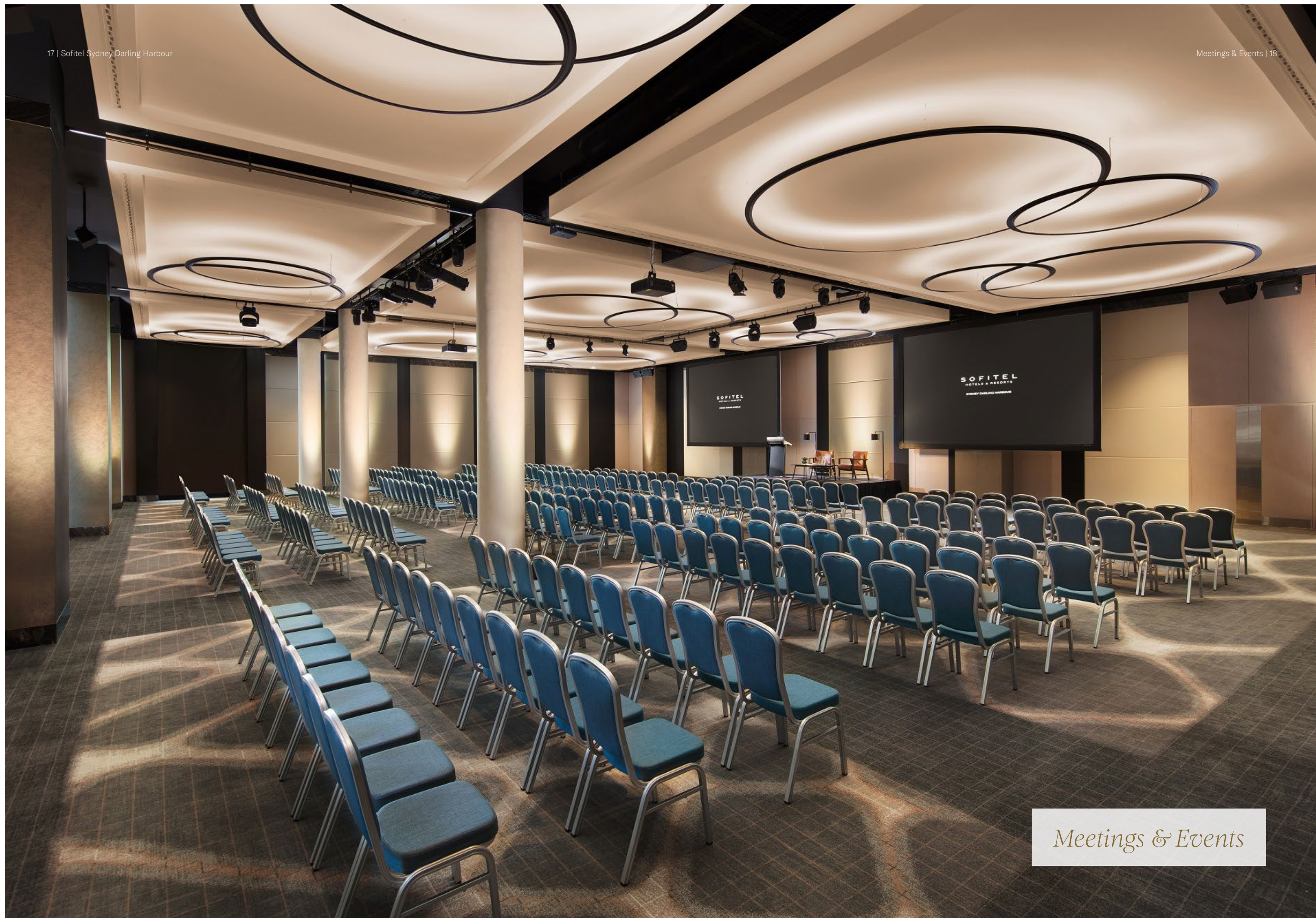
Meetings & Events