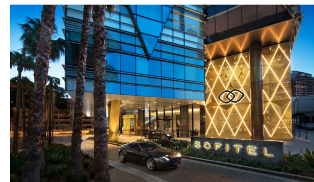
Sofitel Sydney Darling Harbour exterior