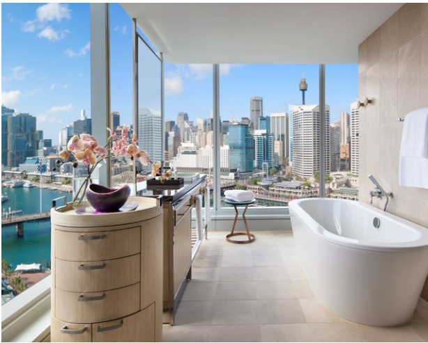
Luxury Corner Room, Darling Harbour View

Soak in your corner bathtub with bespoke French amenities before sinking into your Sofitel MyBed™. Unwind in contemporary French-inspired comfort in your 35sqm (376sqf) room, a peaceful retreat for the night. • LED SMART TV with Chromecast • One king size Sofitel MyBed™ • Air-conditioning with individual room control • Coffee and tea-making facilities • Signature mini-bar • Large shower and bath • Safe deposit box