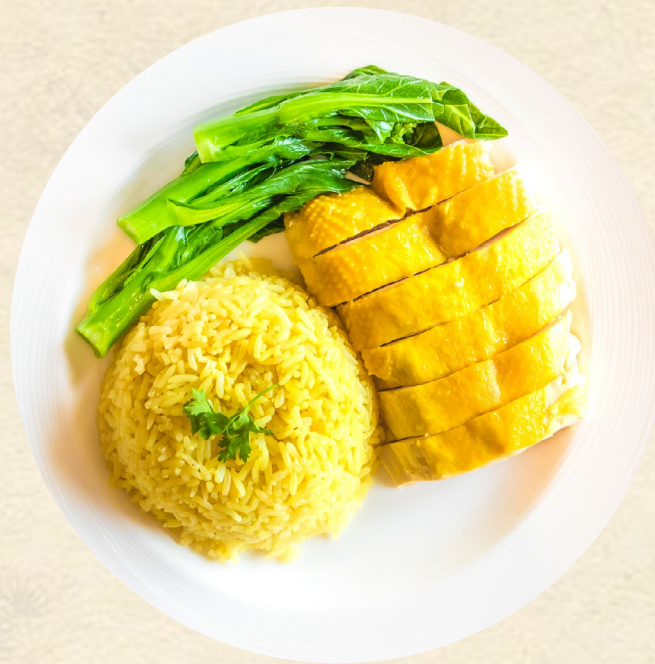
海南鸡飯 8.8 Hainanese Chicken Rice