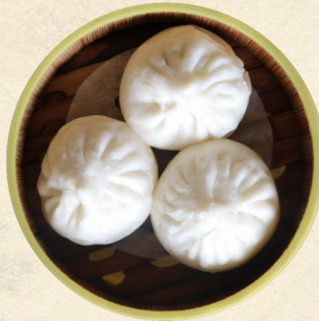
葱香小肉包 3.8 Steamed Pork with Spring Onion Bun