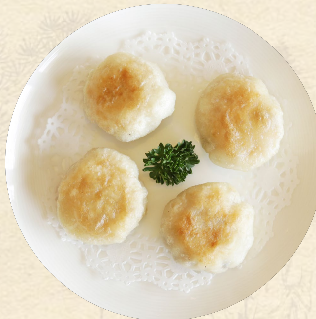
香煎玉米饼 3.8 Pan-fried Shrimp with Pork and Corn