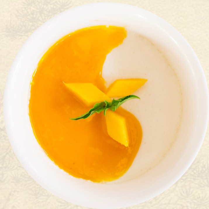
杨枝甘露 Chilled Mango Cream with Sago and Pomelo