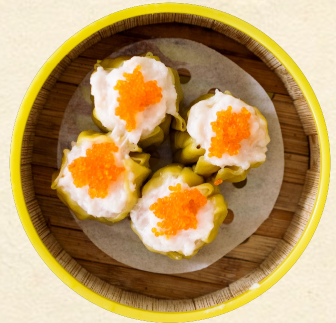
干蒸瑶柱烧麦 3.8 Steamed "Siew Mai" with Dry Scallop