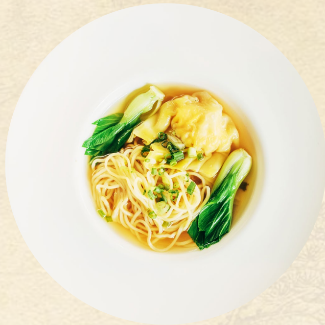
雲吞面湯 8 Wonton Noodle Soup Top Up Chicken or Duck 9.8