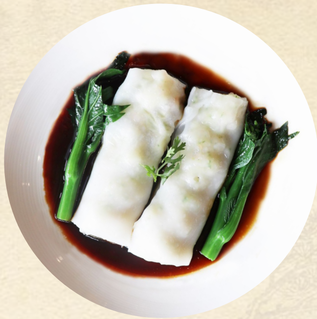
香滑鲜虾肠粉 3.8 Steamed Prawn Rice Roll with Asparagus