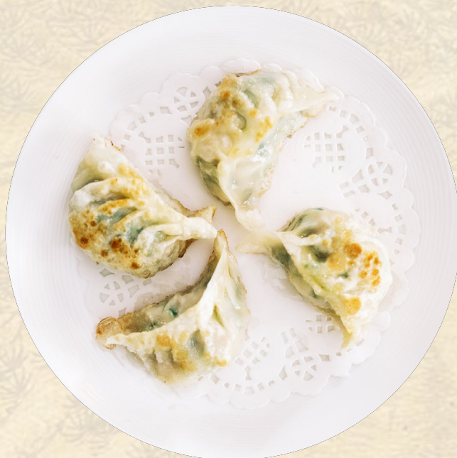
香煎韭菜饺 3.8 Pan-fried Pork Dumpling