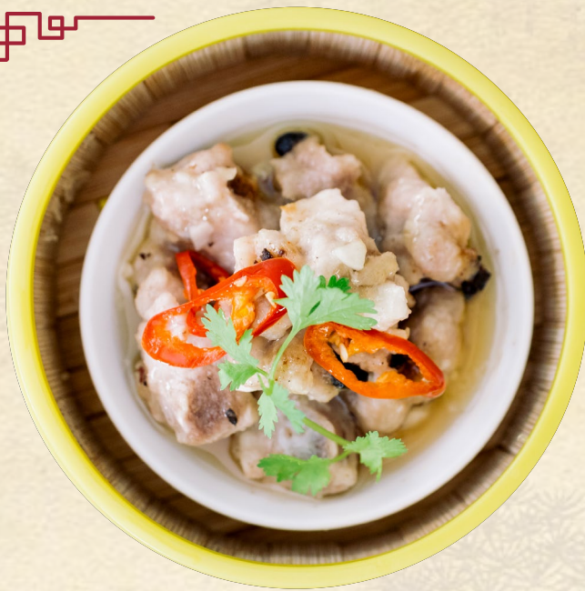
豆豉蒸排骨 3.8 Steamed Pork Ribs with Black Pepper Sauce