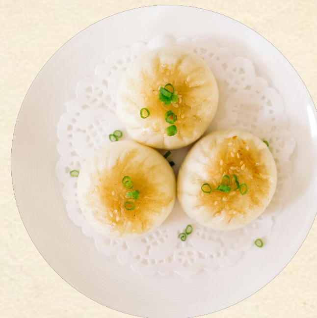
香煎叉烧包 3.8 Pan-fried Barbecued Pork Bun