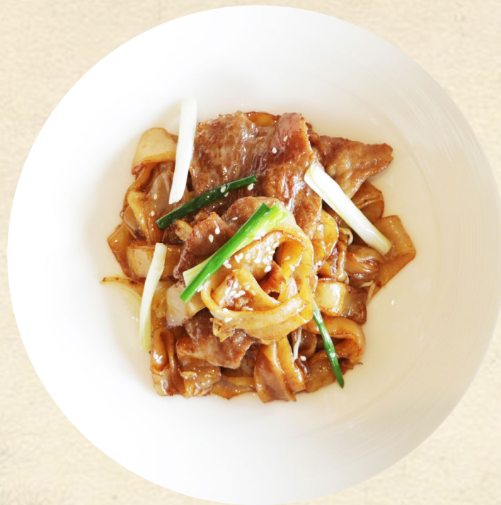
干炒牛河 8 Wok-fried Rice Noodle with Beef and Spring Onion