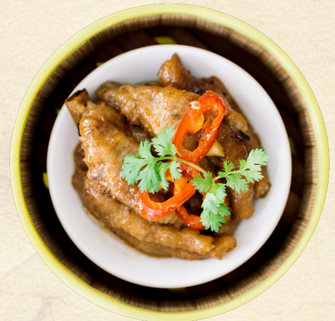
豆豉蒸凤爪 3.8 Steamed Chicken Feet with Black Bean Sauce

Prices are exclusive of 7% service charge and 10% VAT