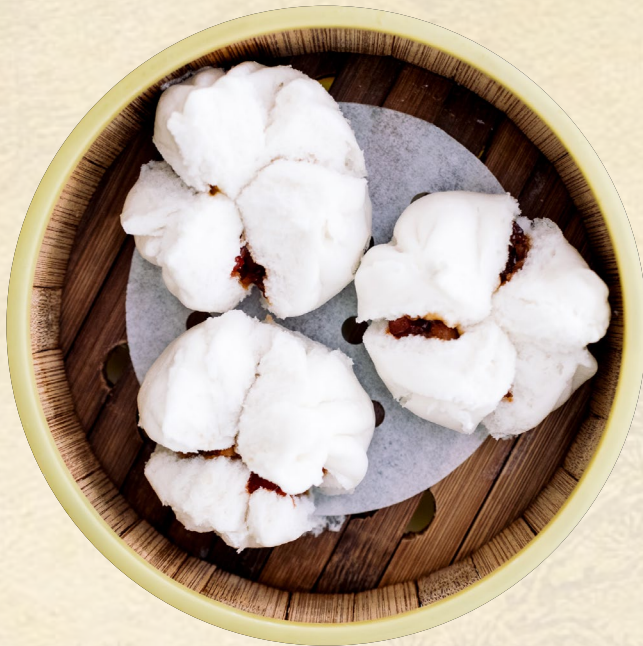
蜜汁叉烧包 3.8 Steamed Barbecued Pork Bun