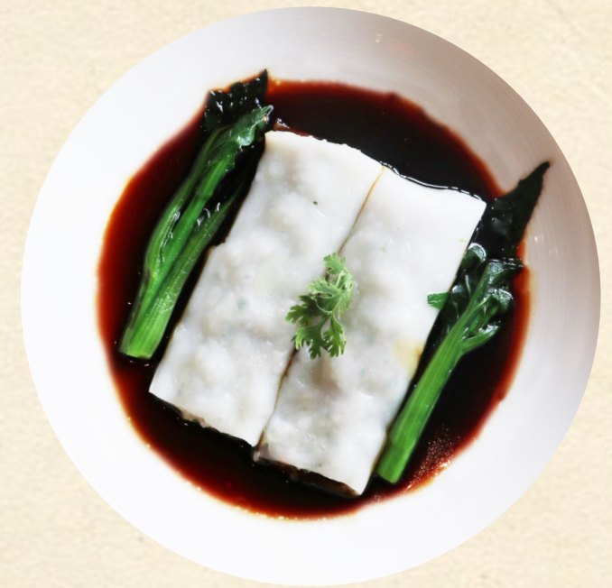
葱香猪肉肠粉 3.8 Steamed Rice Roll with Pork and Spring Onion