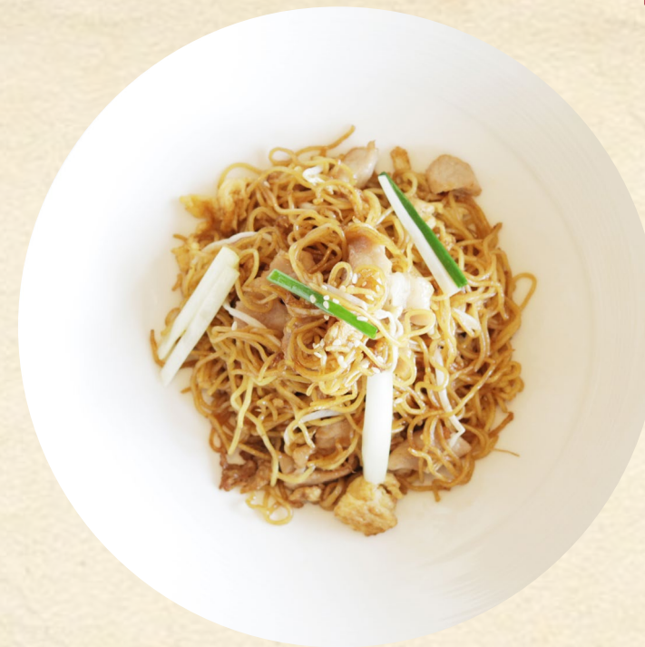
肉丝炒面 8 Wok-fried Egg Noodle with Shredded Pork