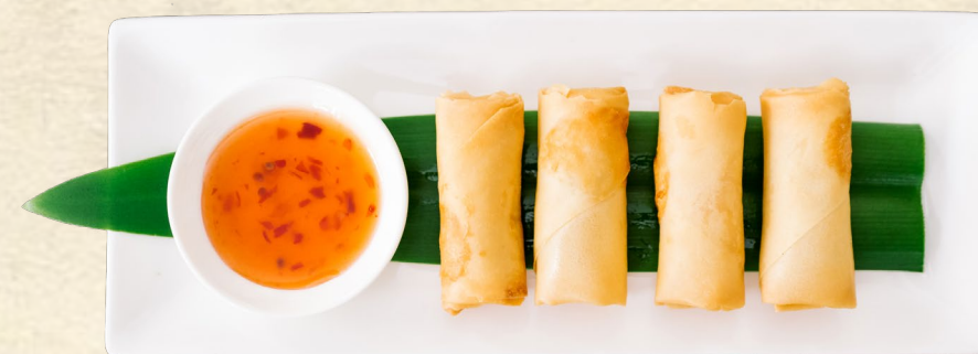
鲜虾炸春卷 3.8 Golden Fried Spring Roll filled with Shrimp

Prices are exclusive of 7% service charge and 10% VAT