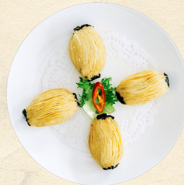
木瓜酥 3.8 Deep Fried Papaya Pastry

Prices are exclusive of 7% service charge and 10% VAT