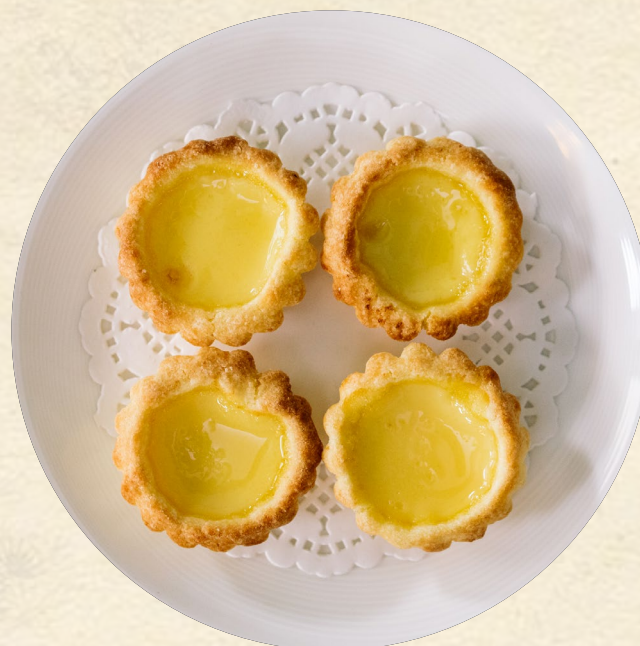
酥皮鸡蛋挞 3.8 Baked Egg Tart