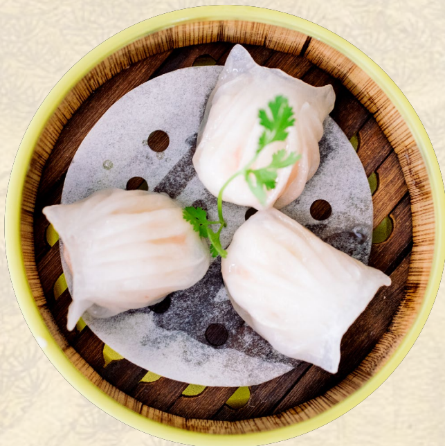
水晶鲜虾饺 3.8 Steamed Prawn Dumpling