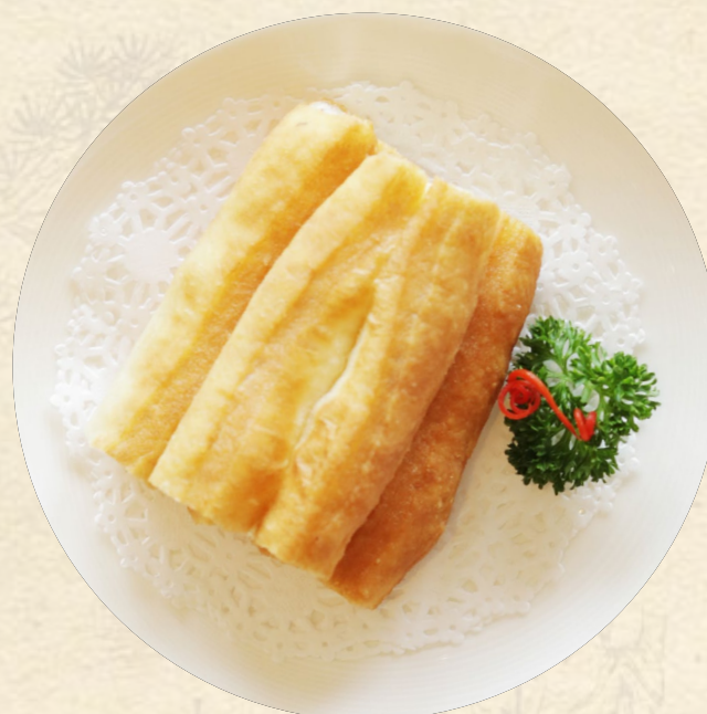
油条 3.8 Youtiao