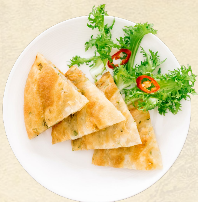
广式葱油饼 3.8 Pan-fried Onion with Ham Pancake