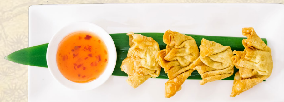
脆皮炸云吞 3.8 Deep-fried Shrimp Wonton