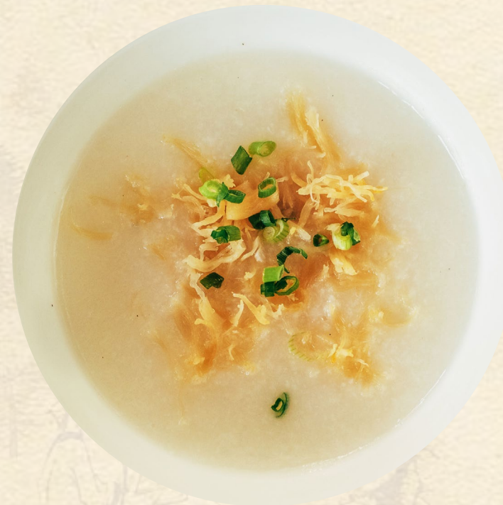
干贝鸡丝粥 3.8 Shredded Chicken Congee with Dried Scallops

Prices are exclusive of 7% service charge and 10% VAT