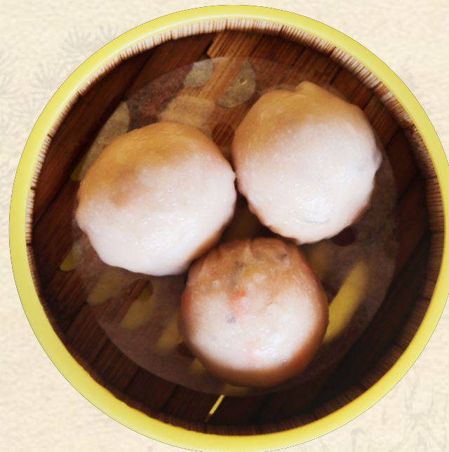
水晶蔬菜饺 3.8 Steamed Vegetarian Dumpling