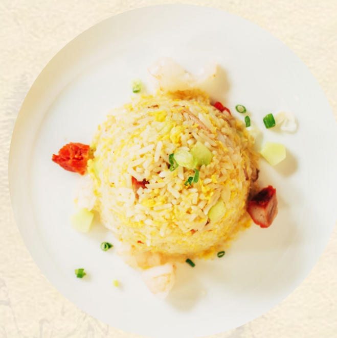
揚州炒飯 8 Yong Chow Fried Rice

Prices are exclusive of 7% service charge and 10% VAT