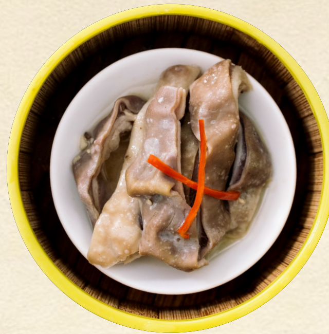
黑椒蒸猪肚 3.8 Steamed Pork Tripe with Black Pepper Sauce