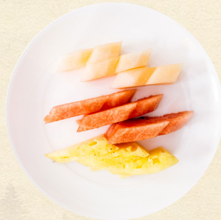
水果拼盘 Fruit Platter