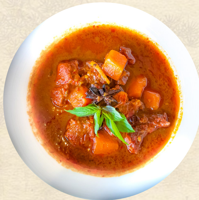
紅燒牛肉面 8.8 Braised Beef with Noodle or Bread