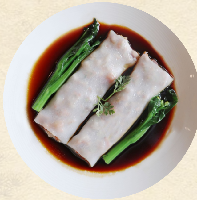
黑椒蒸猪肚 3.8 Steamed Rice Roll with Barbecued Pork