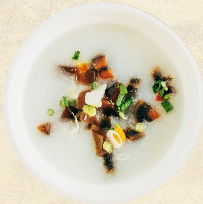
皮蛋瘦肉粥 3.8 Shredded Pork Congee with Preserved Egg