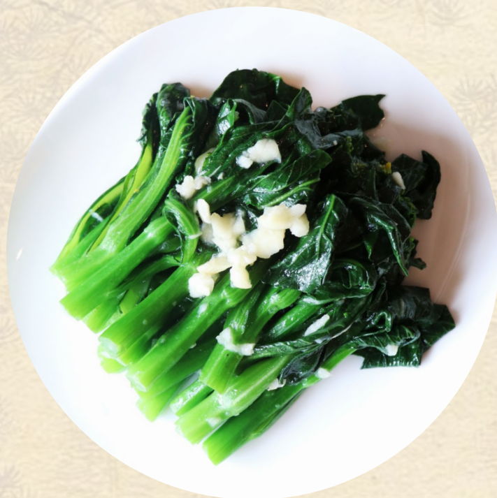
蒜茸菜心 3.8 Sautéed Choy Sum in Garlic