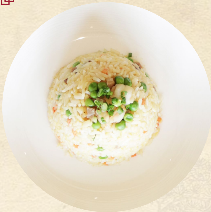
海鲜炒饭 8 Seafood Fried Rice