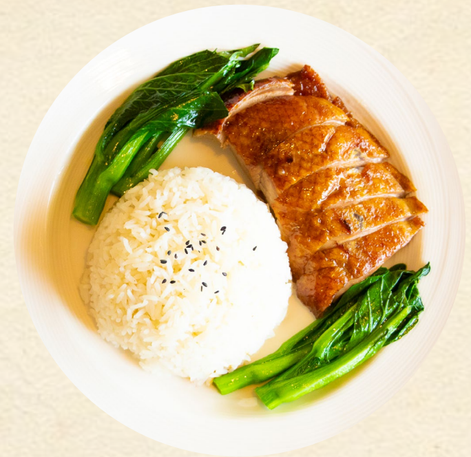
錦江燒臘 8.8 Roasted Duck Rice