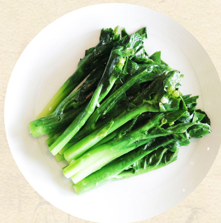
蒜茸芥兰 3.8 Sautéed Kale in Garlic

Prices are exclusive of 7% service charge and 10% VAT