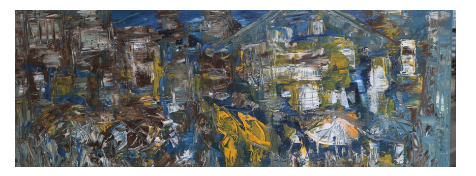
All paintings are available for purchase and can be shipped to your home country. Please see our Ambassadors for more details.